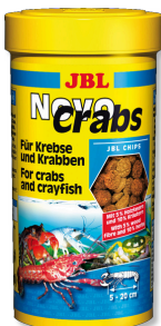
JBL NovoCrabs Main food wafers for crabs