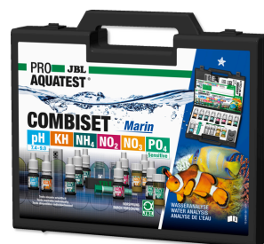
JBL PROAQUATEST COMBISET Marin Test case for water analyses in marine aquariums