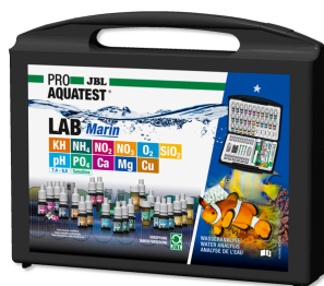
JBL PROAQUATEST LAB Marin Professional test case for marine water analysis