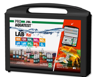
JBL PROAQUATEST LAB Koi Professional test case for koi and garden ponds