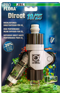
JBL PROFLORA Direct High performance direct diffuser for CO2