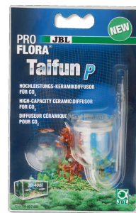
JBL PROFLORA Taifun P Mini CO2 diffuser for nano freshwater aquariums