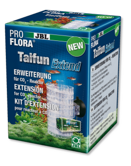
JBL PROFLORA Taifun Extend Extension for CO2 highperformance diffuser