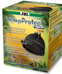
JBL TempProtect light Reptile thermal burn protection for JBL TempSets