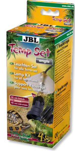
JBL TempSet angle Installation kit for lamps in terrariums