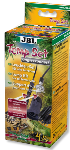
JBL TempSet angle+ connect Installation kit for lamps in terrariums