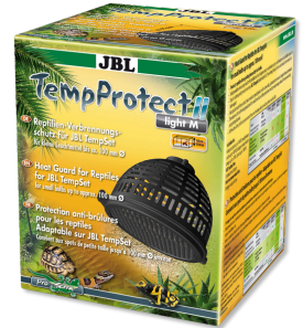
JBL TempProtect II light Reptile thermal burn protection for JBL TempSet items