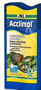
JBL Acclimol Water conditioner for acclimatisation