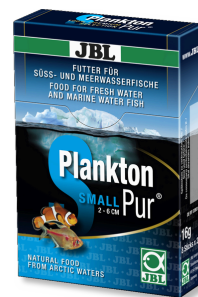
JBL Plankton Pur SMALL Treats for small aquarium fish