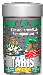
JBL Tabis Premium food tablets for freshwater and marine fish