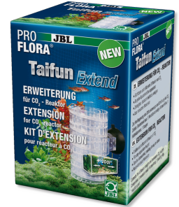
JBL PROFLORA Taifun Extend Extension for CO 2 high-performance diffuser