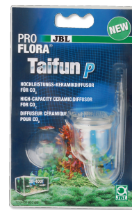
JBL PROFLORA Taifun P Mini CO 2 diffuser for nano freshwater aquariums