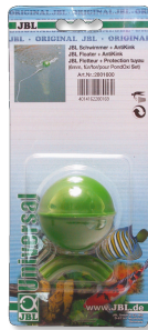
JBL Floater + AntiKink Floater with anti-kink protection for PondOxi-Set