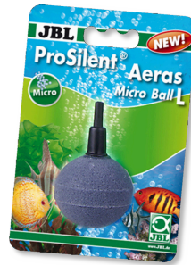
JBL ProSilent Aeras Micro Ball L Air stone for fine air bubbles