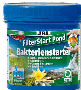
JBL FilterStart Pond Bacteria starter for pond filters