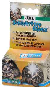
JBL Tortoise shell care Shell care for tortoises