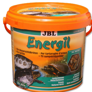
JBL Energil Main food for turtles and pond terrapins