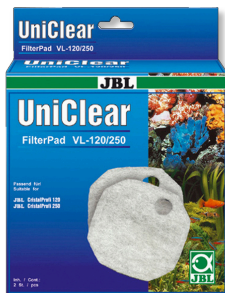
JBL FilterPad VL Cotton fleece for CristalProfi aquarium filters