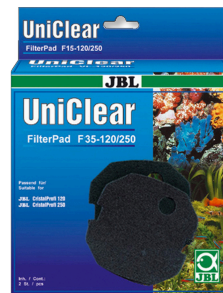
JBL FilterPad F35 Fine foam pad for aquarium filter CristalProfi