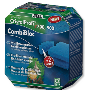
JBL CombiBloc CristalProfi e Pre-filter pads and filter foam for CristalProfi e