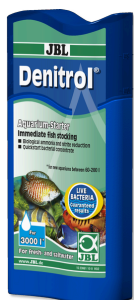
JBL Denitrol Bacteria starter for adding aquarium fish