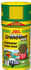
JBL NovoGranoVert mini CLICK

Main food granulate for plant-eating fish