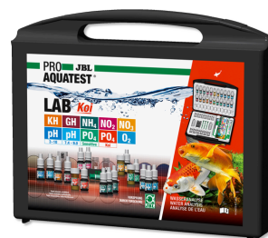
JBL PROAQUATEST LAB Koi Professional test case for koi and garden ponds