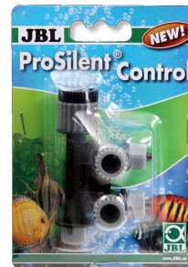
JBL ProSilent Control Adjustable precision air shut-off valve