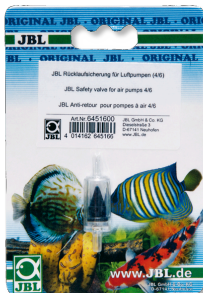
JBL backflow protection Backflow stop for air pumps