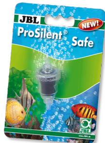
JBL ProSilent Safe Water backflow stop