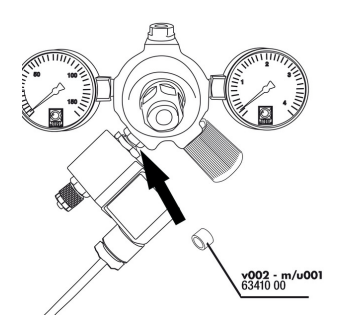
JBL ProFlora "u/m" flat seal