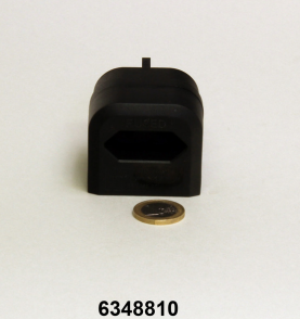
JBL adapter UK for all flat-pin plugs