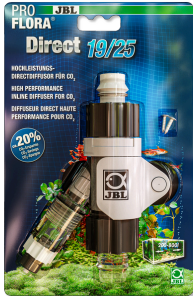
JBL PROFLORA Direct High performance direct diffuser for CO 2