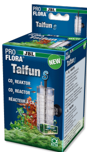
JBL PROFLORA Taifun S Extendable CO 2 diffuser for small aquariums