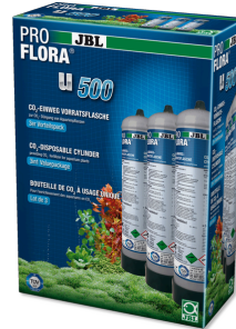
JBL PROFLORA 3 x u500 CO 2 disposable storage cylinder