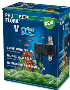
JBL PROFLORA v002 Noiseless solenoid valve