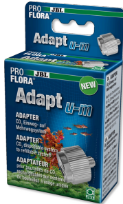
JBL PROFLORA Adapt u-m Conversion adapter for the change over from disposable to refillable cylinder system