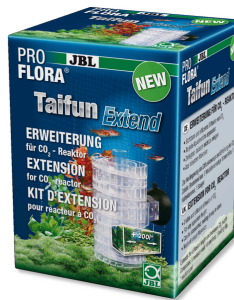
JBL PROFLORA Taifun Extend Extension for CO 2 high-performance diffuser