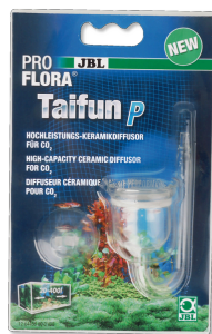
JBL PROFLORA Taifun P Mini CO 2 diffuser for nano freshwater aquariums