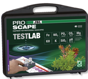
JBL Testlab ProScope Test case for water analysis in plant aquariums