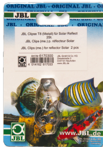
JBL Clips T5/T8 (Metal) Metal holder für fluorescent tubes