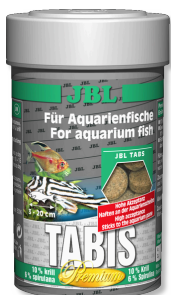
JBL Tabis Premium food tablets for freshwater and marine fish