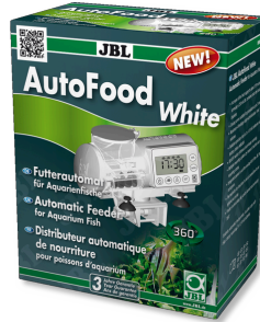
JBL AutoFood WHITE White automatic feeder for aquarium fish