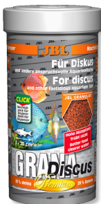
JBL GranaDiscus Premium main food granulate for discus fish