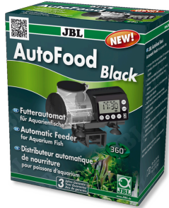
JBL AutoFood BLACK Black automatic feeder for aquarium fish