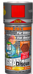
JBL GranaDiscus CLICK Premium main food granulate with doser for discus fish