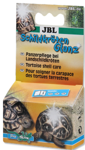
JBL Tortoise shell care Shell care for tortoises