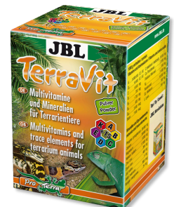
JBL TerraVit Powder Vitamins and trace elements for terrarium animals