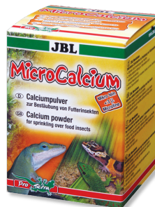
JBL MicroCalcium Mineral supplementary food for all reptiles