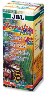
JBL TerraVit fluid Vitamins and trace elements for terrarium animals