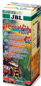
JBL TerraVit fluid Vitamins and trace elements for terrarium animals