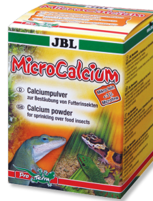
JBL MicroCalcium Mineral supplementary food for all reptiles