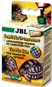
JBL Tortoise Sun Terra Vitamins for tortoises