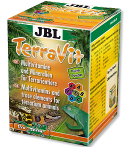
JBL TerraVit Powder Vitamins and trace elements for terrarium animals