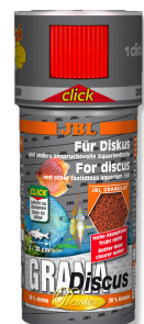
JBL GranaDiscus CLICK Premium main food granulate with doser for discus fish