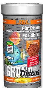
JBL GranaDiscus Premium main food granulate for discus fish