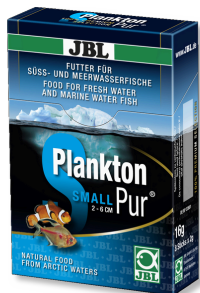
JBL PlanktonPur SMALL