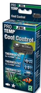
JBL PROTEMP CoolControl