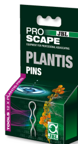
JBL PROSCAPE PLANTIS PINS Plant pegs for the anchoring of aquarium plants