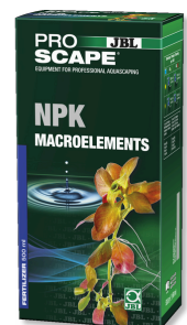
JBL PROSCAPE NPK MACROELEMENTS 3-component plant fertiliser for aquascaping