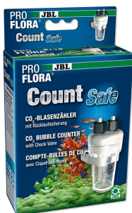
JBL PROFLORA CO2 Count Safe