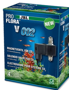
JBL PROFLORA v002

Fitting to reduce pressure for 2 CO2 diffusers