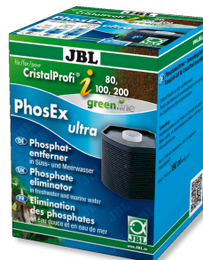
JBL PhosEx Ultra CristalProfi i60/80/100/200 Phosphate remover cartridge for JBL CristalProfi i