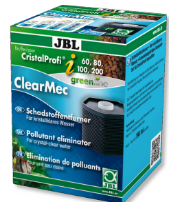
JBL Clearmec CristalProfi i60/80/100/200 Nitrite, nitrate and phosphate eliminator for CP i