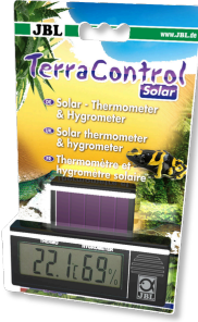
JBL TerraControl Solar Solar-powered thermometer + hygrometer for terrariums