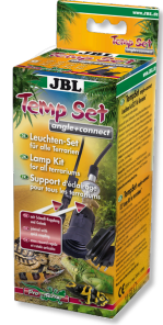
JBL TempSet angle+ connect Installation kit for lamps in terrariums