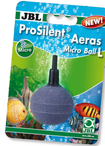
JBL ProSilent Aeras Micro Ball L Air stone for fine air bubbles