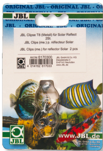
JBL Clips T5/T8 (Metal) Metal holder for fluorescent tubes