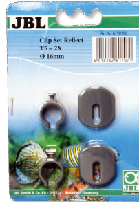
JBL SOLAR REFLECT Clip Set Holder for fluorescent tubes