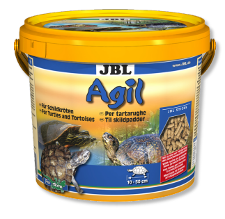
JBL Agil Main foodsticks for turtles 10 -50 cm in size