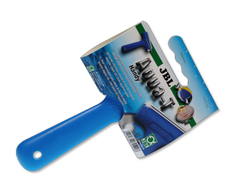
JBL Aqua-T Handy Glass pane cleaner with stainless steel blade