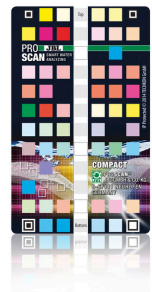
JBL ProScan ColorCard