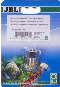
JBL PROFLORA Adapt u201-u500 Adapter for pressure reducer u201