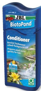
JBL BiotoPond Water conditioner for ponds