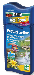
JBL AccliPond Water conditioner for ponds