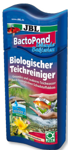
JBL BactoPond Bacteria for biological purification of the pond