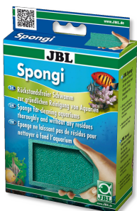
JBL Spongi Cleaning sponge for aquariums and terrariums