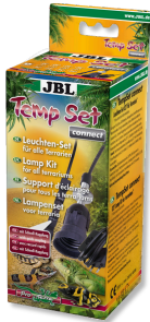
JBL TempSet connect Installation kit with connector