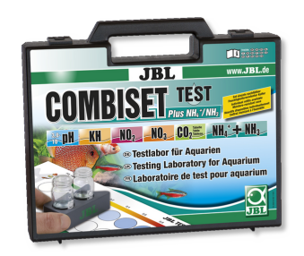
JBL Test Combi Set Plus NH4

Test case with most important water tests + NH4 test