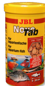
JBL NovoTab Main food tablets for all aquarium fish