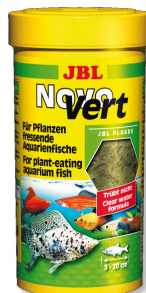
JBL NovoVert Main food flakes for plant-eating fish