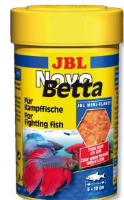
JBL NovoBetta Complete food for labyrinth fish, e.g. fighting fish