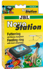
JBL NovoStation Floating feeding ring with water level adaption