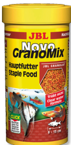
JBL NovoGranoMix Main food for medium-sized and large aquarium fish