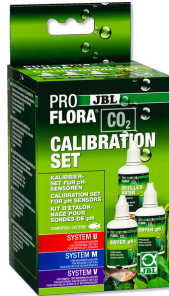
JBL PROFLORA CO 2 CALIBRATION SET To calibrate and store pH electrodes