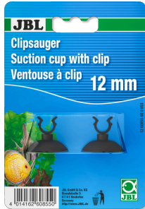
JBL suction cup with clip, 12 mm Rubber suction pads with clips for objects with 12 mm