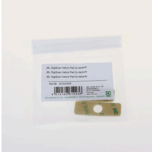
JBL DigiScan Velcro Pad, 2x