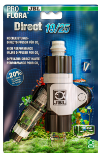
JBL PROFLORA Direct High performance direct diffuser for CO2