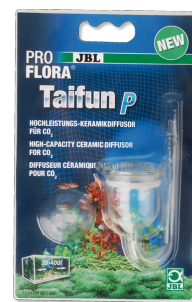
JBL PROFLORA Taifun P Mini CO2 diffuser for nano freshwater aquariums