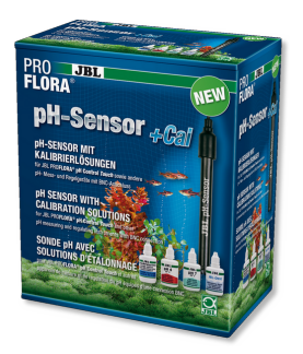
JBL PROFLORA pH-Sensor+Cal