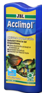
JBL Acclimol Water conditioner for acclimatisation