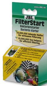
JBL FilterStart Bacteria for the activation of filters