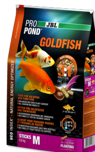
JBL PRO POND GOLDFISH M Food sticks for medium-sized to large goldfish