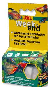
JBL Weekend Weekend complete food for all aquarium fish