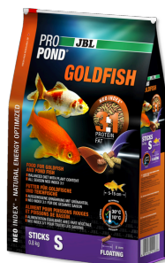
JBL PRO POND GOLDFISH S Food sticks for small goldfish