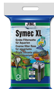
JBL Symec XL Coarse filter wool to remove all types of water cloudiness