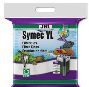
JBL Symec VL Filter wool fleece to remove water cloudiness