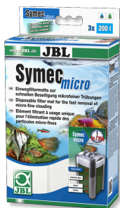
JBL Symec micro Microfibre fleece against water cloudiness