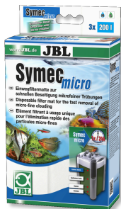
JBL Symec micro Microfibre fleece against water cloudiness